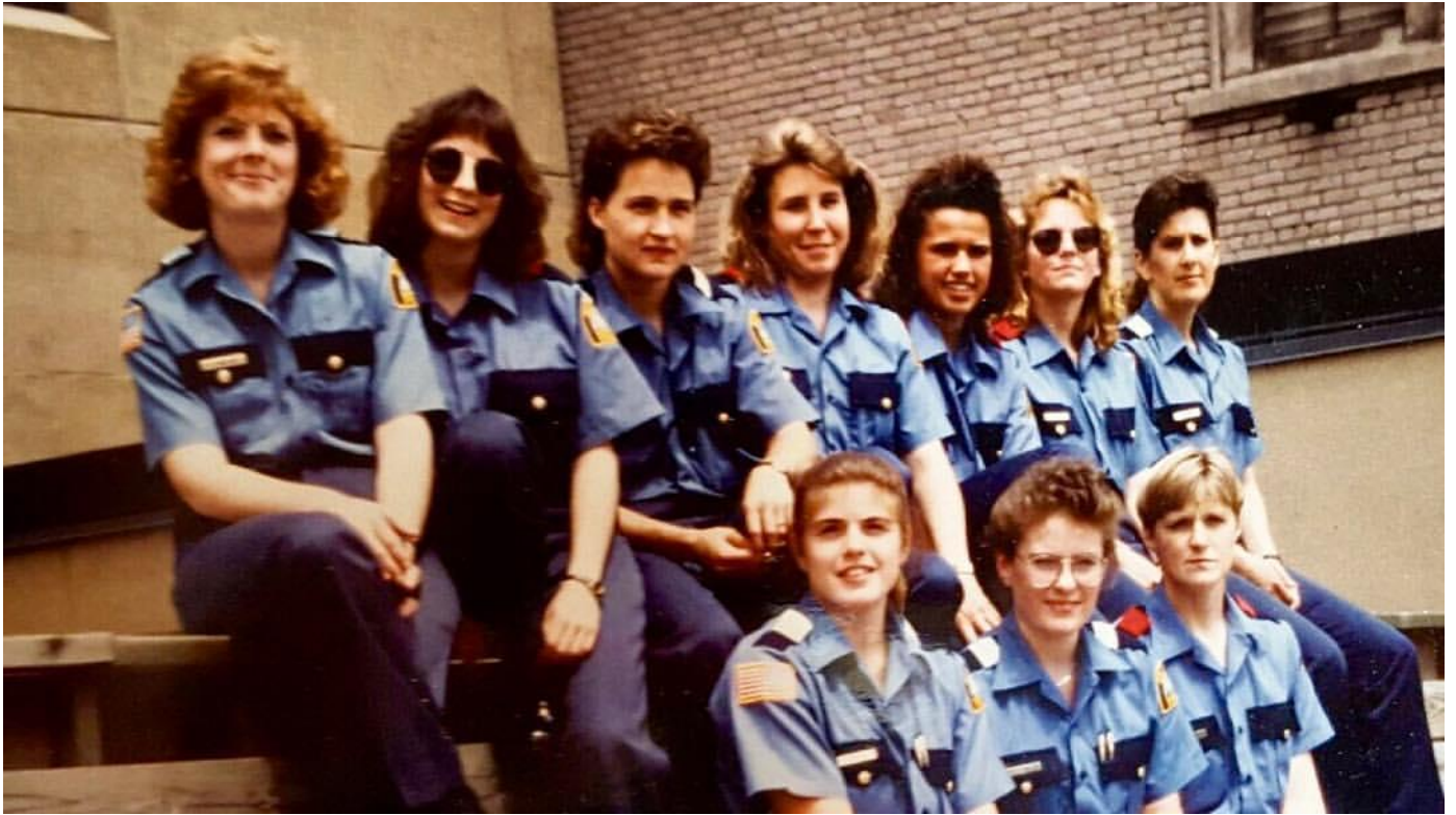
1993-1 Academy Female Officers