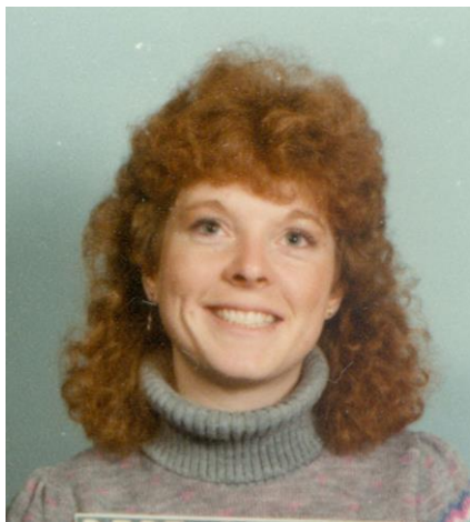
Clerk Typist II 1984