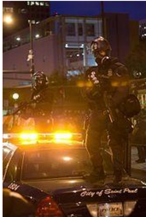
Police in downtown Saint Paul September 2, 2008

did. I knew the actions they were taking. I experienced the attack upon us. One of my gals who was next to me ended up having poop on her glove from a bag that had been thrown overhead. I felt like during the lawsuit then, you have the insurance company rep, and the lawyers that supposedly represented us in the city, and then the city rep. I remember taking a step back and saying it's first the insurance company and then it's the city and then it's the officers.