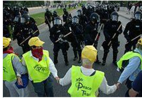
Minnesota Peace Team and Mobil Field Force – September 4, 2008

I still don't even get the purpose of it all. I really don't. I know that in their minds they think that they're making a statement, but damaging people's property and attacking the police because they see us as a form of government, I still don't get. Because I guarantee you, if one of them two weeks after the RNC or a protest finds themselves having had a house that was broken into or being the victim of a robbery or having a little sister who was raped, we sure would be there for them, just like anybody else.